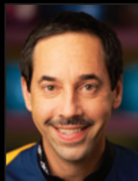
Parker Bohn III