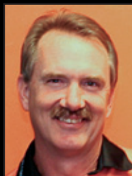
Walter Ray Williams, Jr.